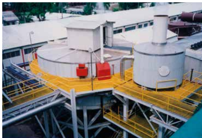
Dominican Republic - 10.4m

With significantly reduced sugar losses and without loss of purity, the Cail & Fletcher short retention time clarifier is a piece of equipment of excellence in terms of clarification of juice