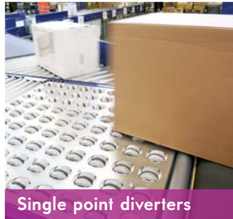
Single point diverters