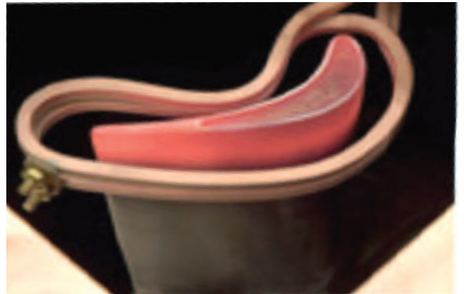
Blade heating before recharging