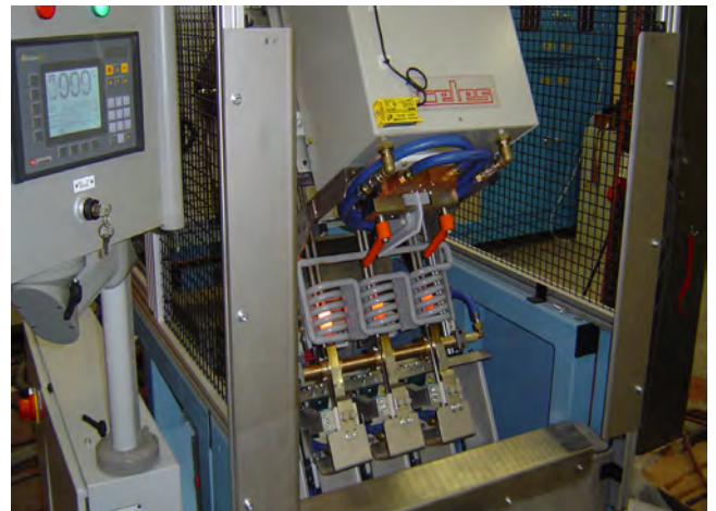
Stamping on automated machine