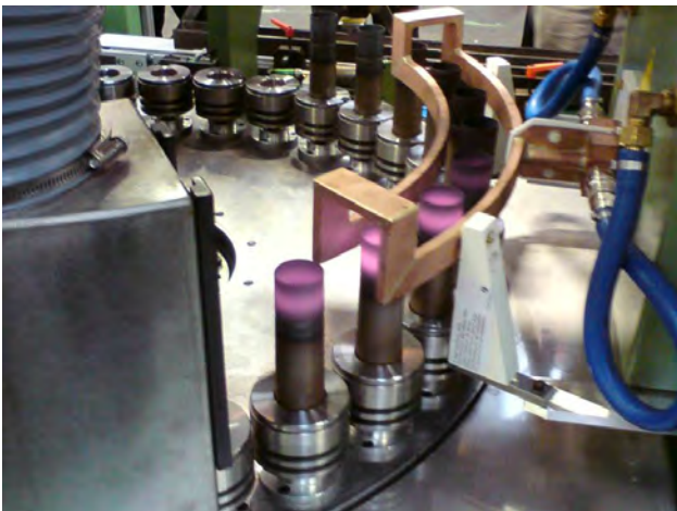
Annealing on an automated carousel