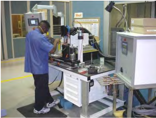
Brazing electric contacts

Specialized since 1967 in electrothermic induction, Fives Celes creates specific induction systems, in order to fulfill clients requests.