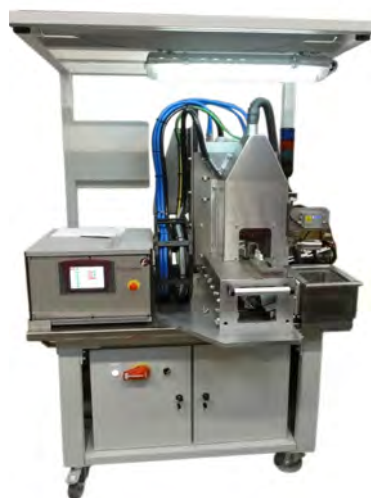
Brazing by induction of electric contacts semi-automatic