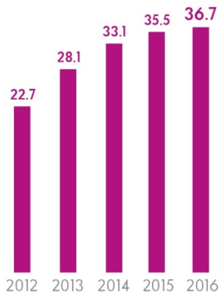
Research & Development (€ millions)

Breakthrough technologies designed to tackle industrial performance challenges