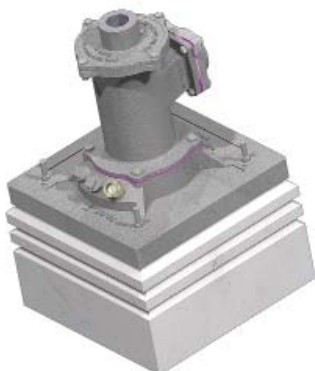
Wall Mounting (flangeless)

Flexible air and gas connections (Bulletin 8770) are recommended to compensate for expansion of furnaces and piping.