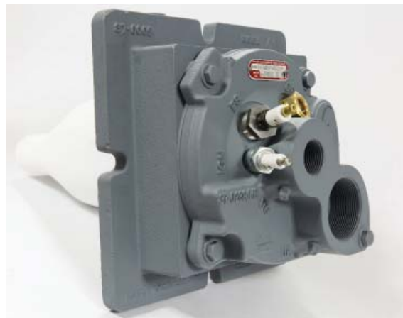
Tempest® DMC. Alumina/mullite tile "A" for fiber wall furnace installation.